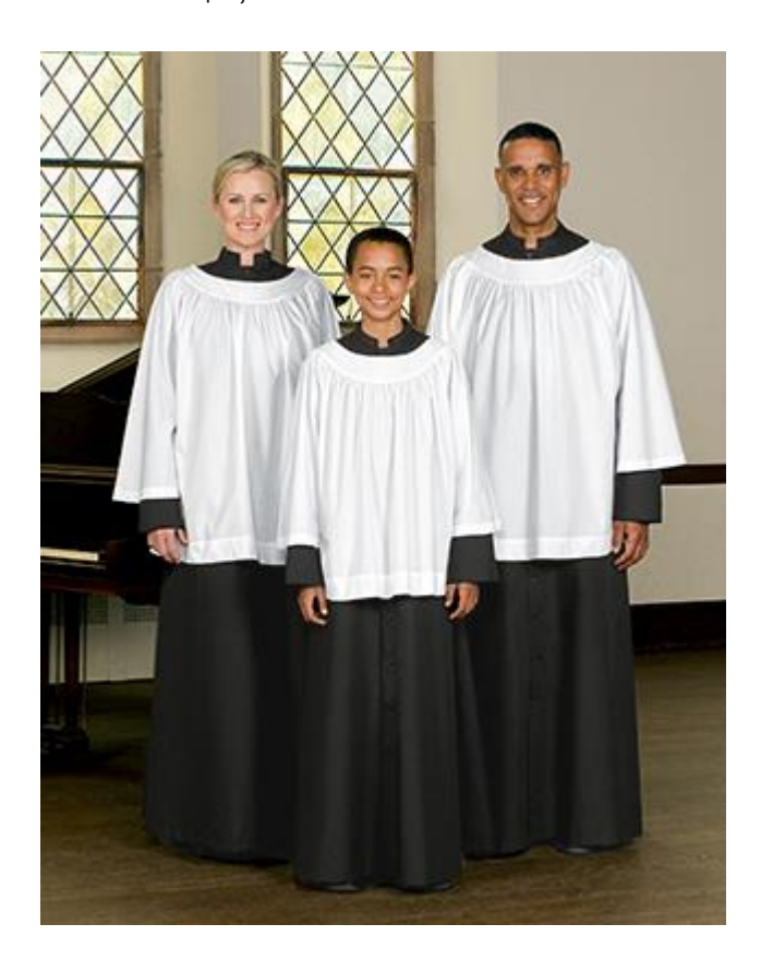
Cost: $150/set with a 10% discount for 12 or more Total Cost $1,620

As an Episcopal School, our community gathers daily in worship using a variety of items that have been consecrated (or set apart as holy). Lower School and Middle School students come to chapel excited to acolyte, yet the current cassock/surplices have been well worn to the point that finding a cassock with closures that snap has become a challenge. We currently do not own cassocks and surplices large enough for Upper School students to wear. By purchasing new vestments in a variety of sizes we will be able to include more students as well as reinforce the value of our chapel services as a time that has been set aside as holy.