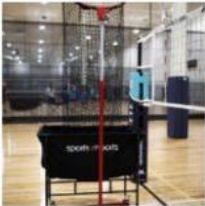
Trainer+ Volleyball Target