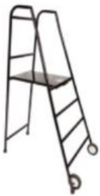
Free Standing Volleyball Official Stand - Official Stand and Padding, Navy